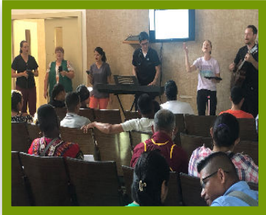
Morning Clinic Worship