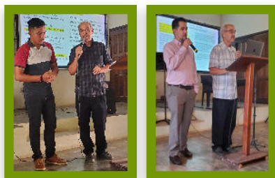
Prayer & Church Services