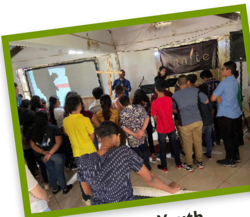
Ignite Youth Conference