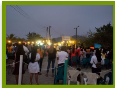
Community Night of Praise