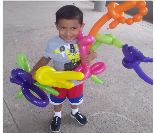
Above: Scenes from GH2K's recently celebrated Kinder graduation