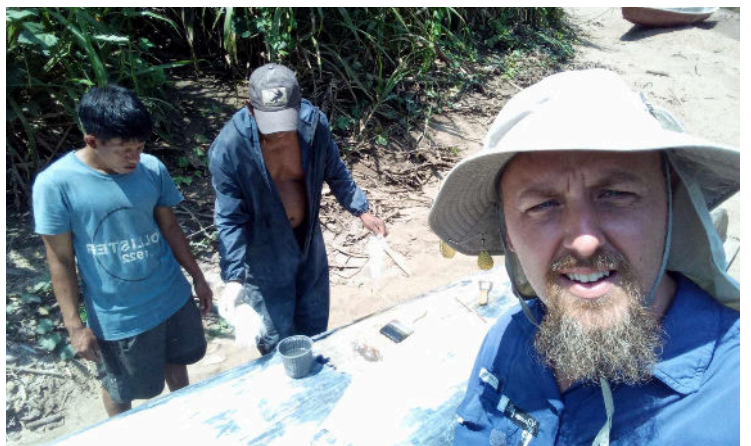
Patching a fiberglass canoe