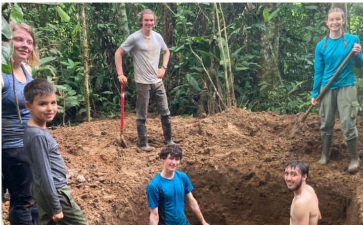
Outhouse hole digging!