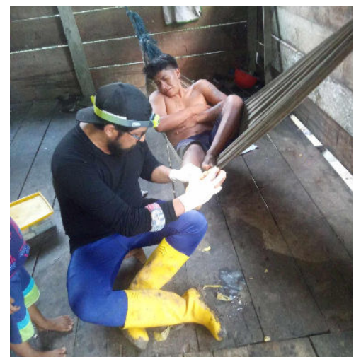
Treating a stingray wound