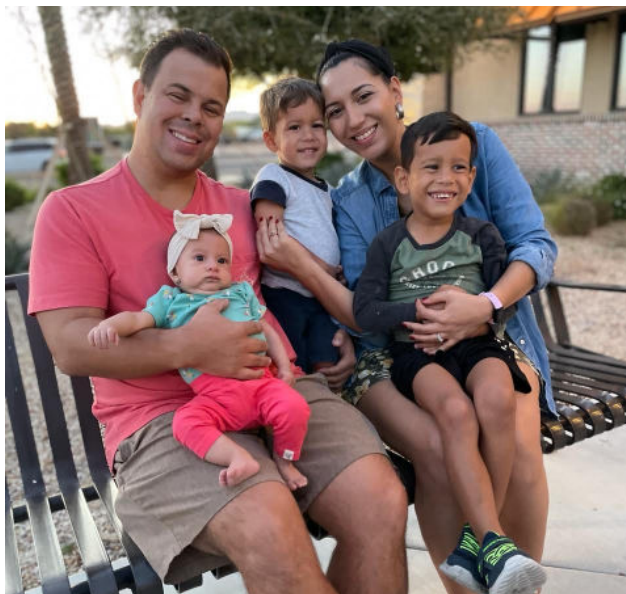
A family photo of us visiting Arizona last month then went to Texas after to visit family and supporters.

are tired and have heavy loads, and I will give you rest. Accept my teachings and learn from me, because I am gentle and humble in spirit, and you will find rest for your lives. The burden that I ask you to accept is easy; the load I give you to carry is light.” (Matthew 11:28-30). I encourage you, mother or not, to take some time today to do just that. Go to Jesus and release your heavy loads or any weariness you are experiencing, especially when doing good for others. You are loved. You are seen. The Lord is waiting for you, always.