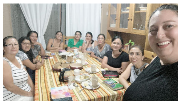
Women's Bible study