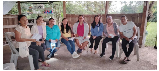
Wao women's Bible Study