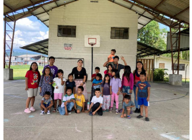
Children's Wao Bible study

Please continue praying for everything that God has put in our hands be a light in the lives of others!