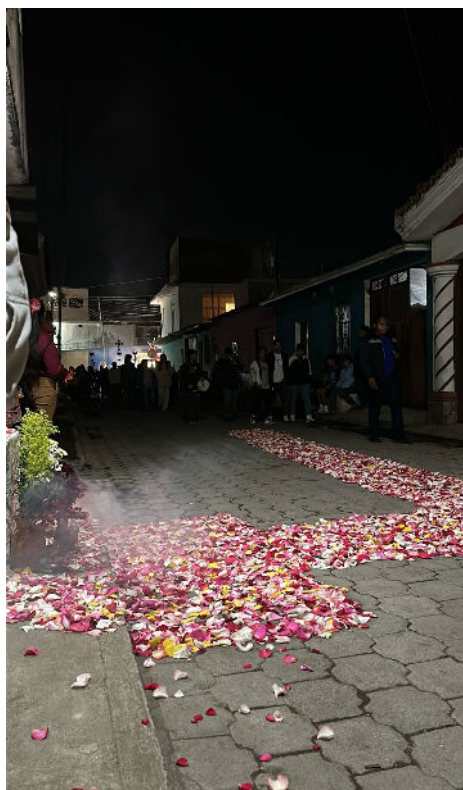
The alfombra (carpet) that leads to the "shrine."